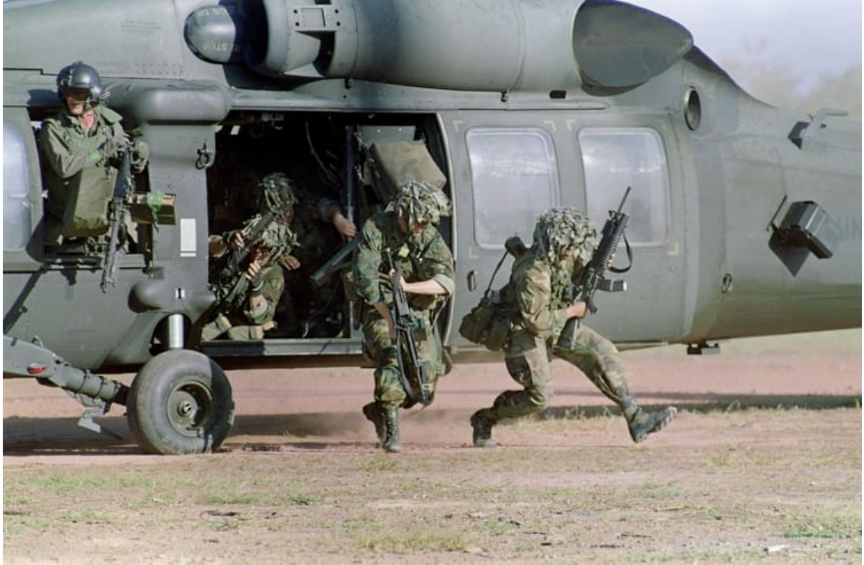
United States Invading Panama 1989 Image via SFGate .

The spirit of the red horse is manifested today in the USA and his major allies (the other G7 nations). This is why USA is unofficially called the “world police.”