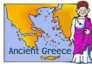
The Legacy of Ancient Greece

Ancient Greece Legacy, The Important Legacy of Greece